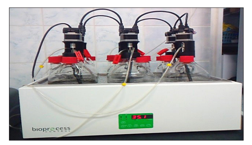
Figure 2 . Set up for biogas potential determination. Bioreactor Simulator (Bioprocess Control, Sweden)

and soil grain composition. The humidity and dry matter content were determined by using the losson-drying method at the temperature of 105°C to constant weight (PN-EN 15934:2013-02). Dry organic matter content and ash content (content of inorganic substances) were determined on the basis of the mass loss-on-ignitionat the temperature of 550°C The dried samples were calcined in a muffle furnace to constant weight. The pH was measured using the potentiometric method in an aqueous suspension, which was obtained by mixing the soil sample with distilled water in the ratio of 1:5 (v:v). An Elmetron CP-401 pH meter with a calomel electrode (combined) was used for the measurement. The bulk density of soil was determined with the Kopecky cylinder method. The hydrometric method was used with the use of a Prószyński hydrometer, in which 40 g of air-dried soil sample (sieve with mesh size of 2.0 mm) was used for each field, with the temperature in each cylinder equal to 22°C