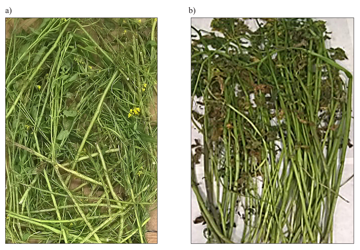
Wierzbica Emilianów Figure 1. White mustard biomass (above-ground parts) harvested from different locations

with the mass of approximately 1.5 g were subjected to mineralization in the mineralizing block of the apparatus at a temperature of 420°C in accordance with the guidelines found in the application note no. 3503. After cooling, the mineralisate was placed in a distillation unit. Determination of nitrogen was performed by titrating 0.1N distillate with a hydrochloric acid solution. Simultaneously, a blank test was performed.